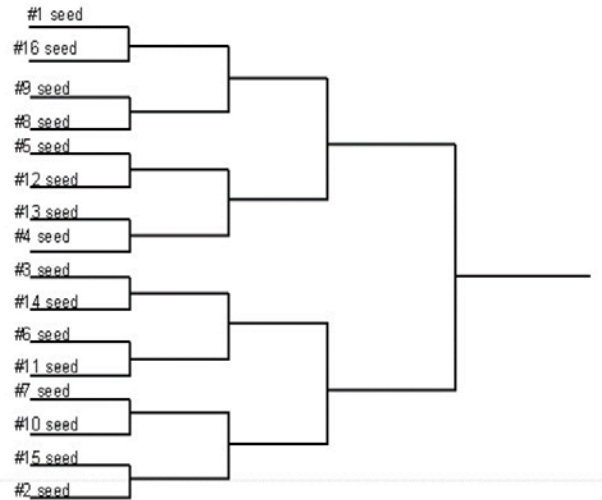
Day 2 Competition Bracket (with seeding based on Day 1 results)